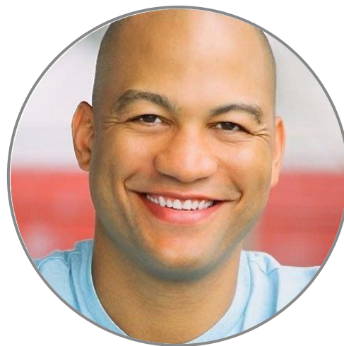
Lifetime Arts Trainer Performing Arts Teaching Artist