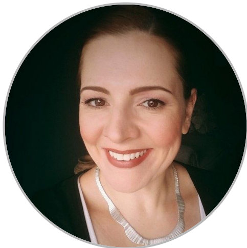
Lifetime Arts Trainer Dance Teaching Artist