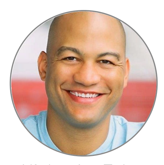
Lifetime Arts Trainer Performing Arts Teaching Artist