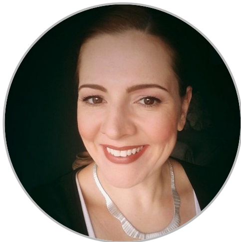
Lifetime Arts Trainer Dance Teaching Artist